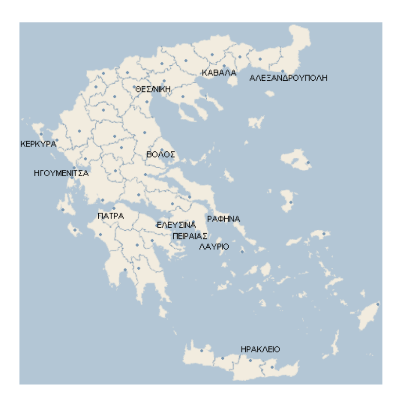
Figure 1: Greece's 12 top-tier ports

The main activities of the 12 top-tier ports are summarised in Table 1.