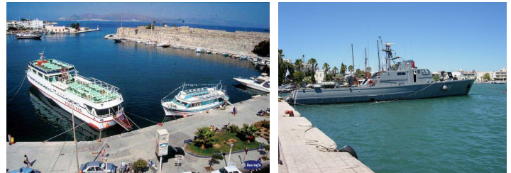
The port of Kos

practical and viable prefeasibility study for the new commercial port in order to contribute in the best possible manner to the progress and further development of the island.