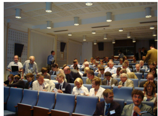
The workshop auditorium

In addition to corridor selection, the Helsinki workshop also covered the work performed under the project on the Key Performance Indicators to be used for benchmarking the selected corridors. Presentations were also given on the related EU-funded e-Freight project, and a tool developed by the Swedish company Conlogic on the evaluation of transport’s environmental performance.