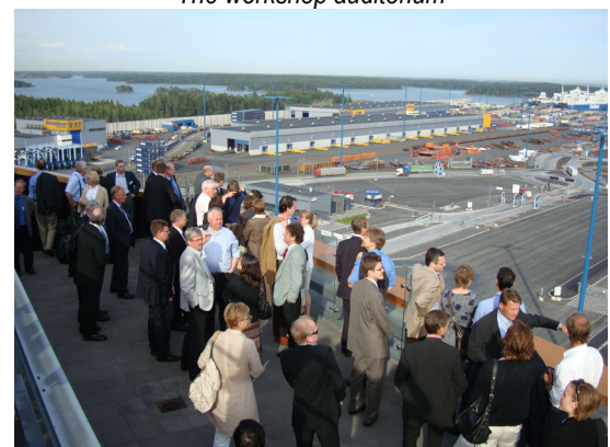
From the visit to the port of Helsinki

A lively discussion took place among the stakeholders and the members of the project’s Advisory Committee who were also invited to the event. Based on the valuable input received, the Project’s Management Committee concluded at a selection of 9 corridors to be used for benchmarking and further analysis in the project.